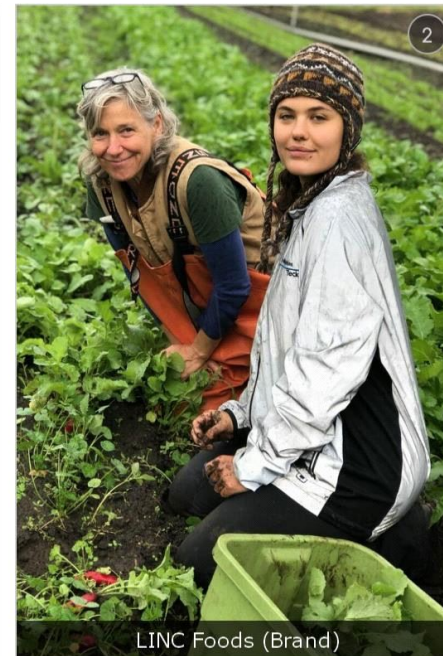
LINC Foods (Brand)