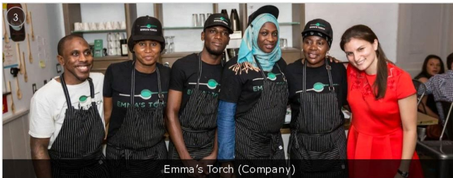
Emma's Torch (Company)