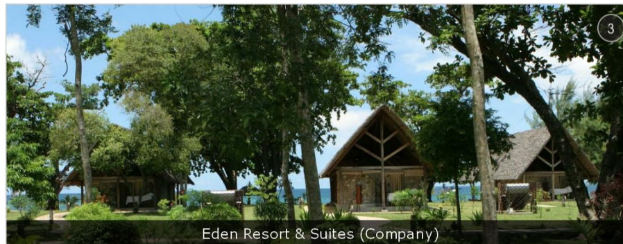
Eden Resort & Suites (Company)