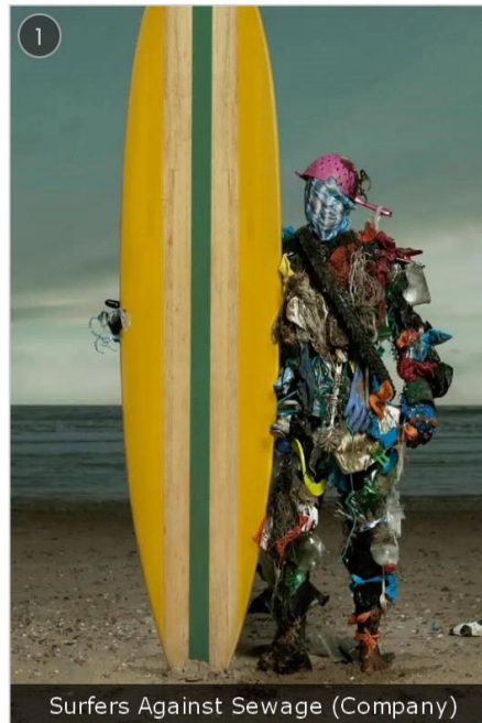
Surfers Against Sewage (Company)

3 Penda Photo Tours offers affordable photo tours and photography volunteer programs in diverse settings in Cape Town, South Africa. In addition to gaining photography skills, participants have the opportunity to benefit local organizations in need by providing them with high-quality images to be used for vital promotion and outreach purposes.