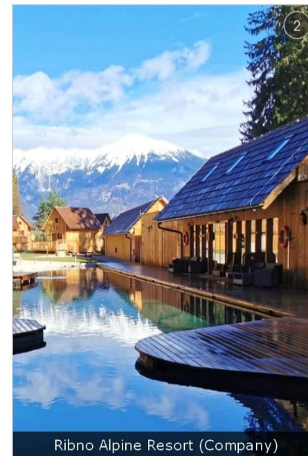
Ribno Alpine Resort (Company)